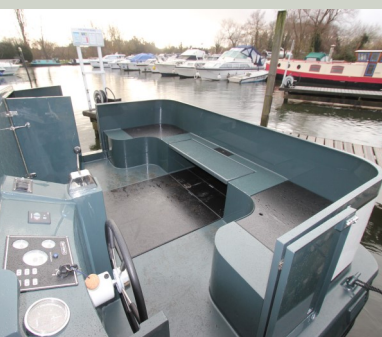
Euro cruiser with seating and steel side doors (additional cost)