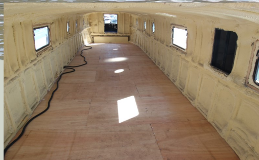
After spray foam insulation