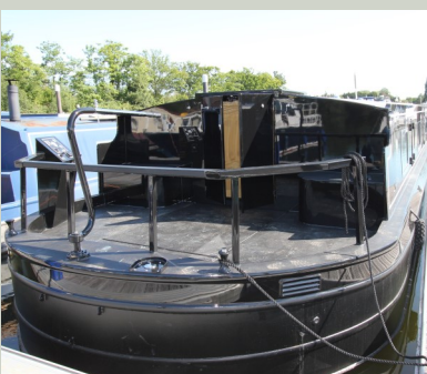
Standard Cruiser Stern