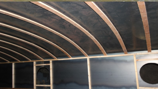
Wooden battening before spray foam insulation