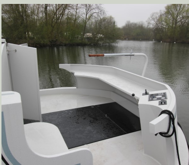
Lux Stern (additional cost)

THE DETAILS ON THIS SPECIFICATION SHEET ARE CORRECT AT THE TIME OF WRITING BUT ARE LIABLE TO CHANGE WITHOUT NOTICE