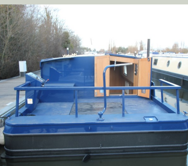
Standard square cruiser Stern