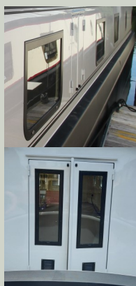
BLACK PACK MUSHROOM VENTS WINDOW AND DOOR FRAMES